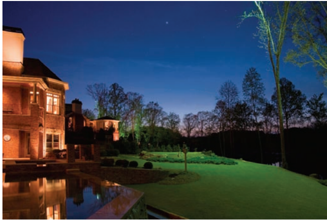
Moon lighting of the lawn with back architectural lighting reflected in pool.