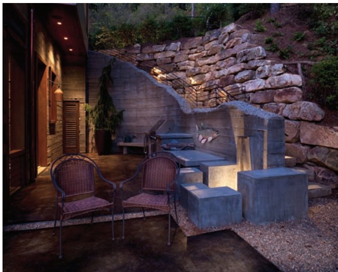
Step lights provide safety on the stairway while an underwater light accents the water feature.

When talking with your clients about landscape lighting, explain the benefits that lighting can bring to their home. Have them look at their beautifully landscaped yards during the day, then ask them to remember how that beauty disappears at night. Landscape lighting can transform this black hole into a visually stimulating and safe landscape.